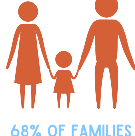
ARE 2 ADULT HOMES